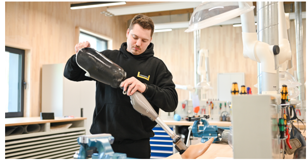
The new UNBROKEN Prosthetic and Orthotic Center in Lviv trains specialists in the field of prosthetics to respond to the urgent need for prostheses.