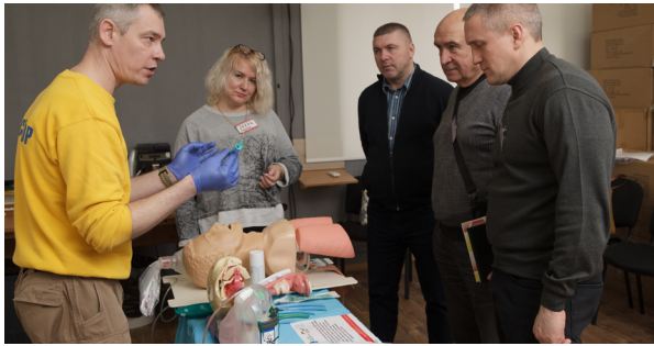
The Programme Hospital Partnerships trains employees from the fire brigade, police, civil defence, mine action and communities in emergency aid.