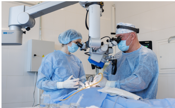
Doctors remove a dangerous abscess from the ear of a three-year-old child at a Children's Hospital in Kyiv.

Germany's support for a stronger healthcare system in mental health and psychosocial support, rehabilitation and eHealth.